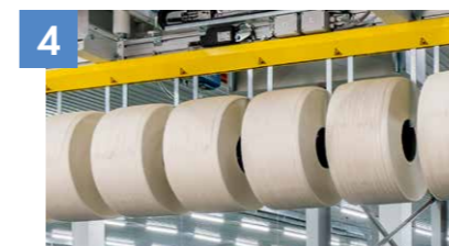
Compatible with LTS and trolley