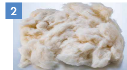
ONLINE NOIL MONITORING