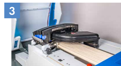
Superior quality on 12 heads